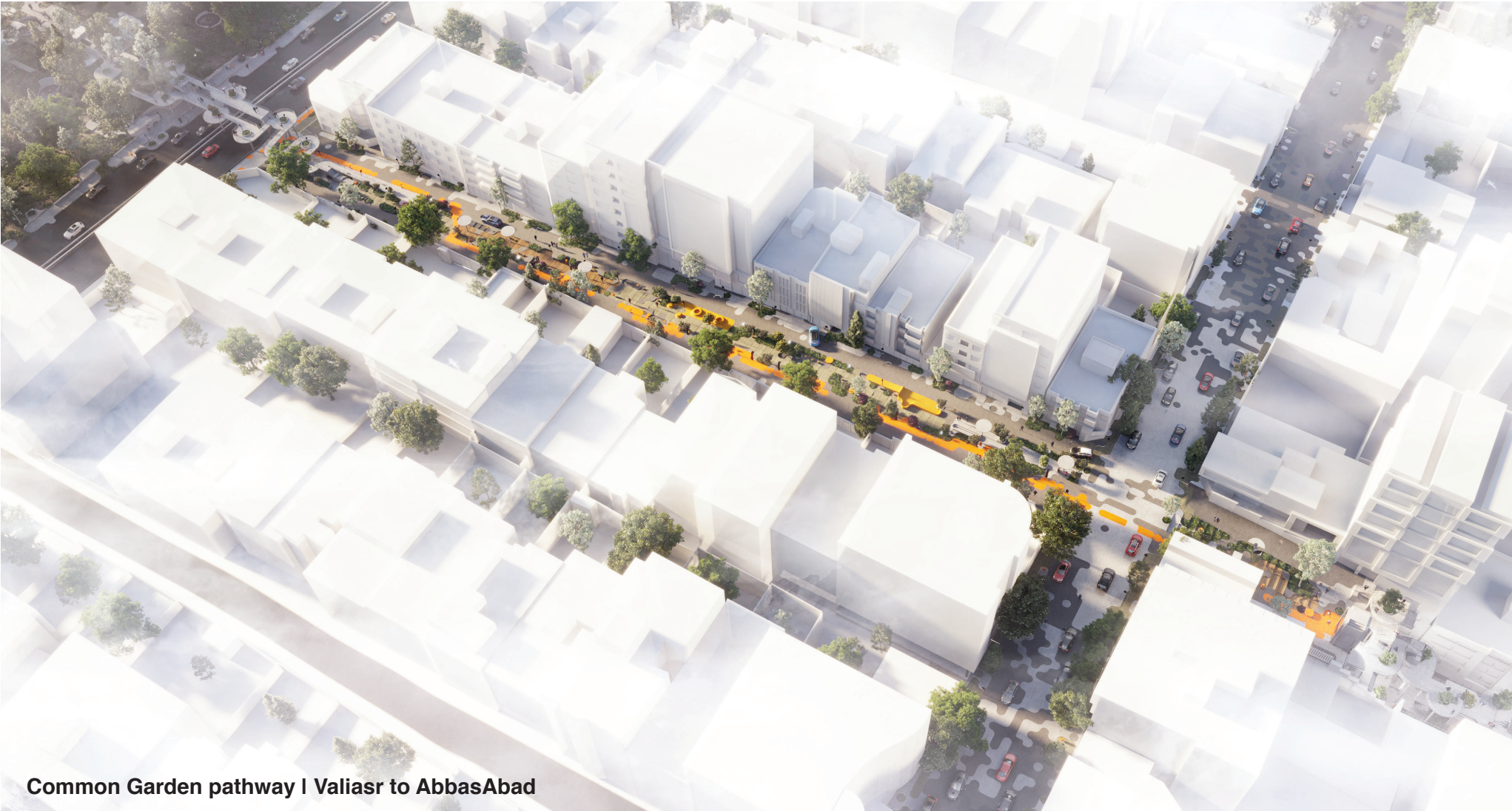
Common Garden pathway | Valiasr to AbbasAbad

Removal of existing stairs and protrusions at Shafagh dead-end.