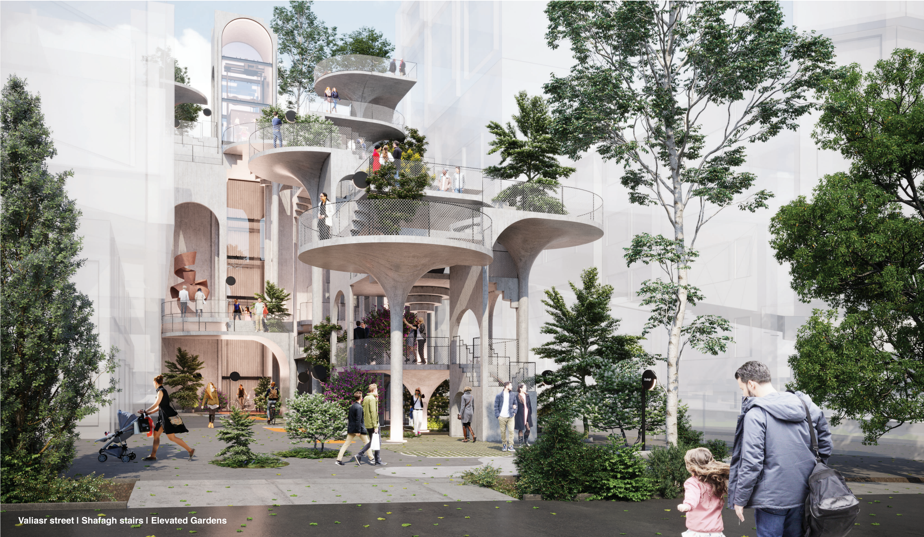
Valiasr street | Shafagh stairs | Elevated Gardens