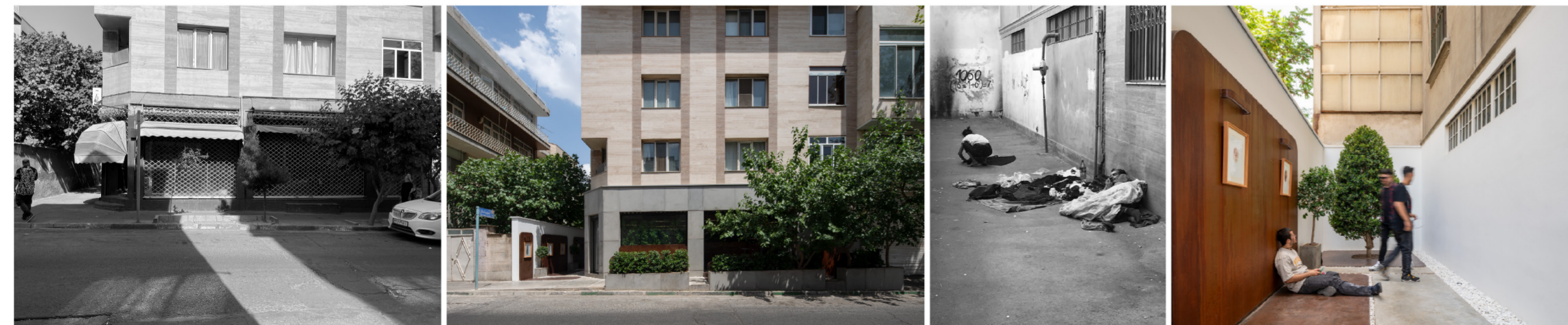
Old (Exterior View)