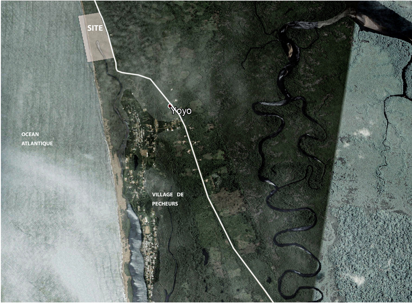
Location of the Site near the fishermen village of Yoyo in Mouanko