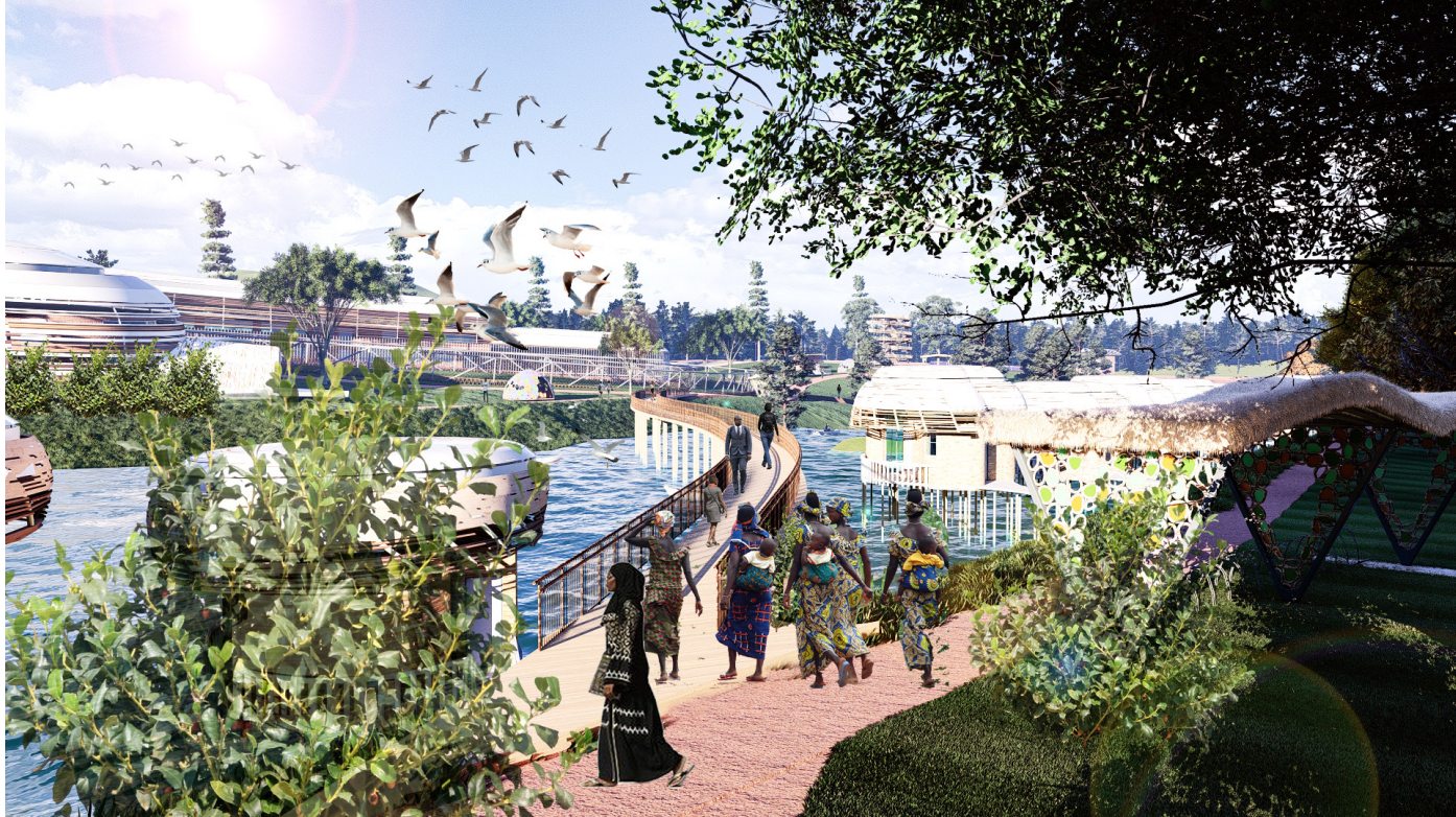
View of the wooden walkway connecting the spaces of the complex and ensuring the continuity of the tourist experience