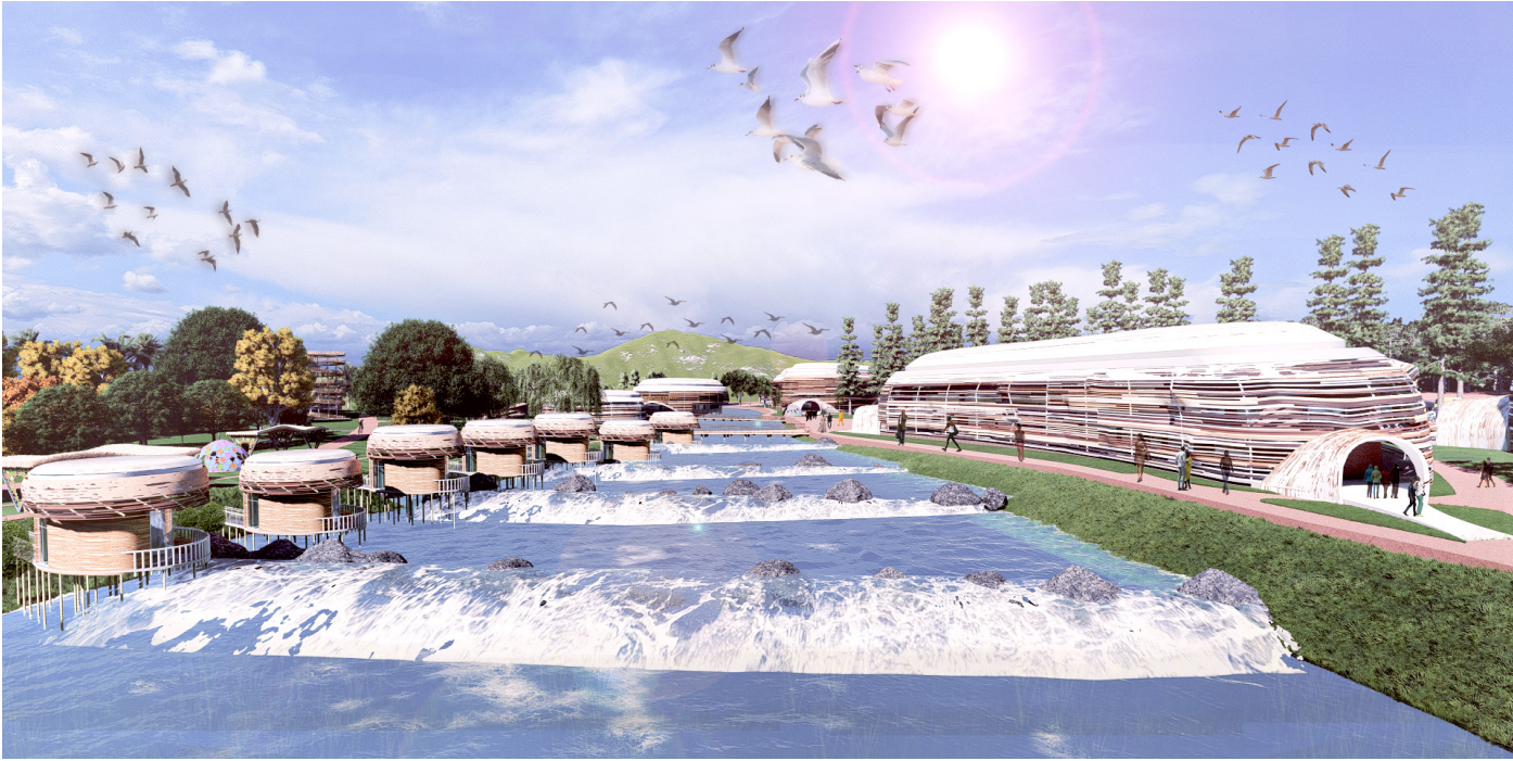
Seen on the small waterfalls reminding of the natural spaces of our countryside