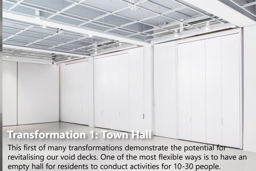
Transformation 1: Town Hall This first of many transformations demonstrate the potential for revitalising our void decks. One of the most flexible ways is to have an empty hall for residents to conduct activities for 10-30 people.