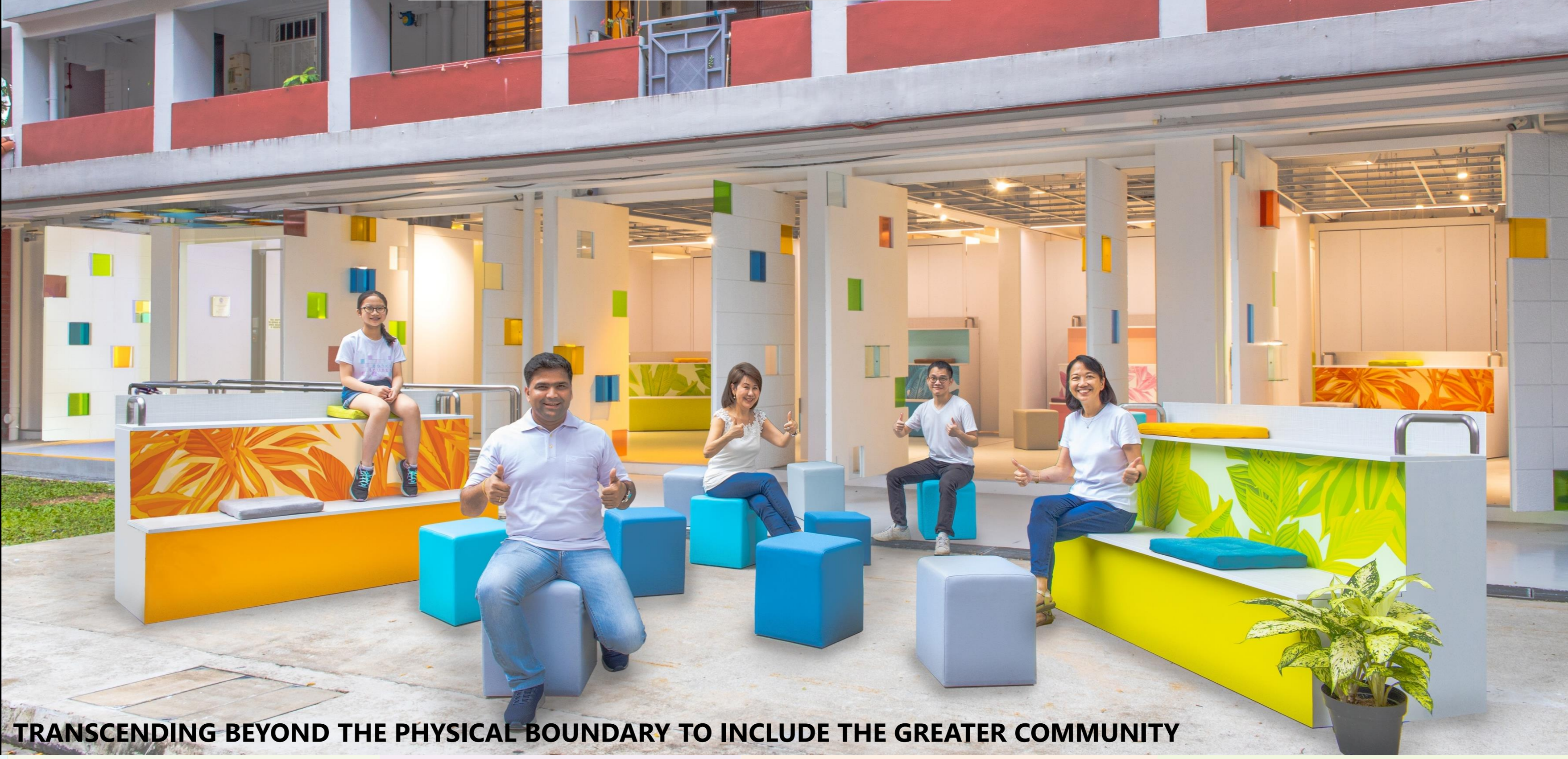
TRANSCENDING BEYOND THE PHYSICAL BOUNDARY TO INCLUDE THE GREATER COMMUNITY