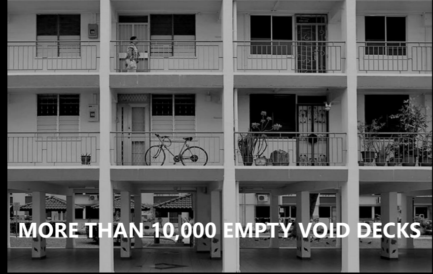
MORE THAN 10,000 EMPTY VOID DECKS

Singapore has its fair share of increasing urban issues. 1. One of them is the vast numbers empty spaces at prime ground floor location: the void deck, which is a raised empty space below apartment blocks.