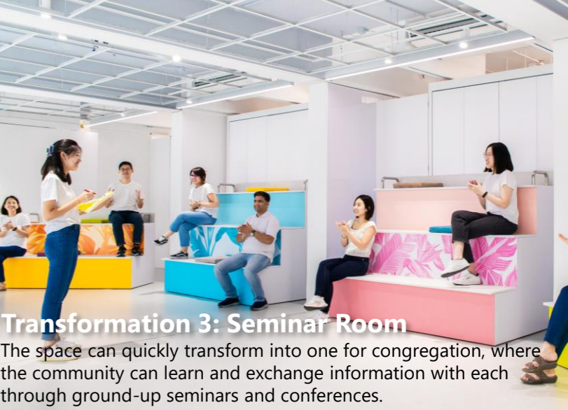
Transformation 3: Seminar Room The space can quickly transform into one for congregation, where the community can learn and exchange information with each other through ground-up seminars and conferences.