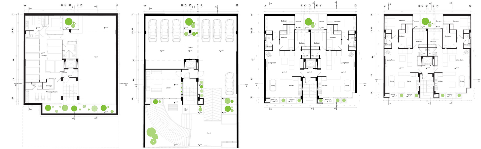
Basement -2 Plan