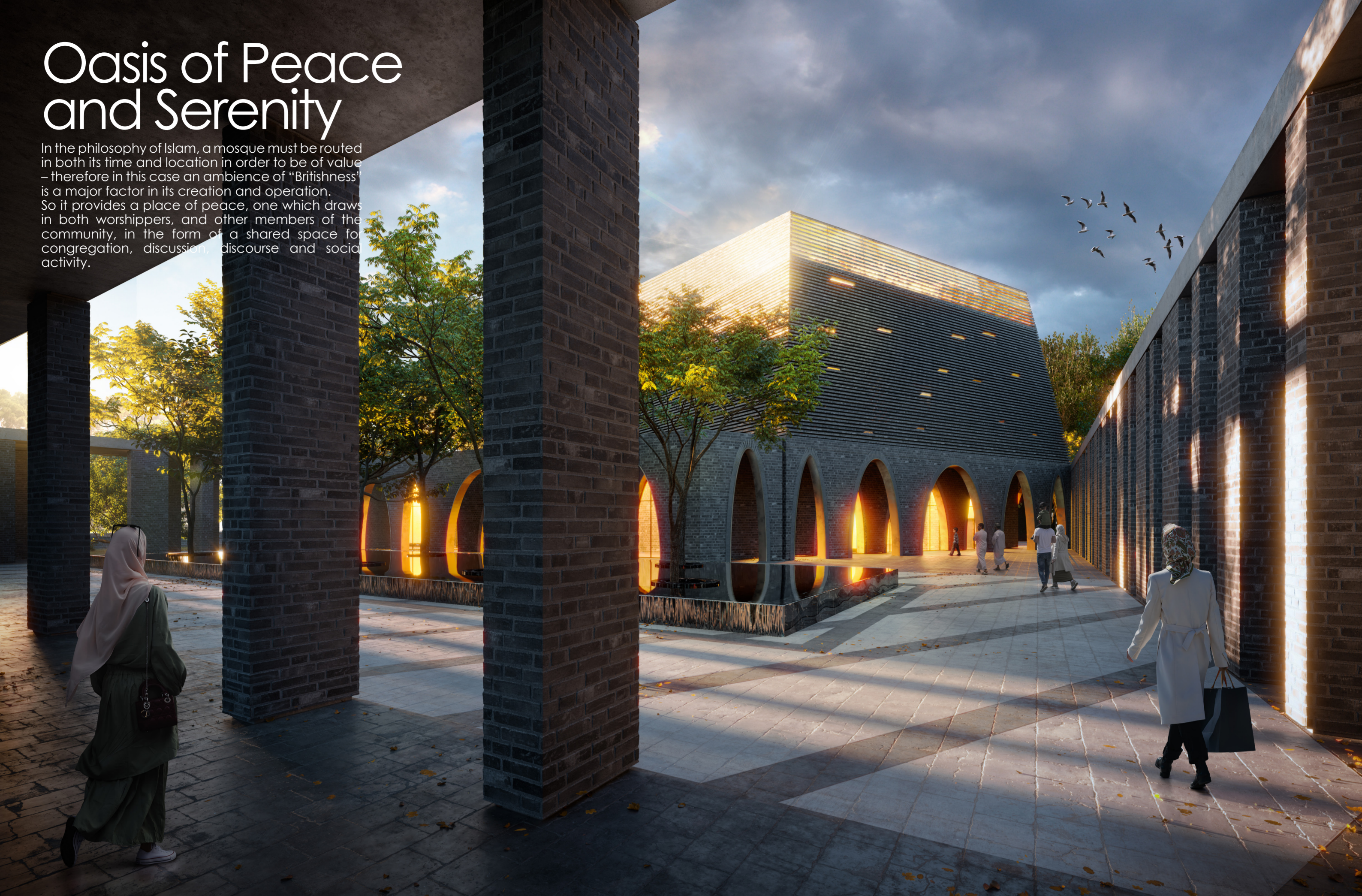
Hilltop Garden with quranic fruits

In the philosophy of Islam, a mosque must be rooted in both its time and location in order to be of value – therefore in this case an ambience of "Britishness" is a major factor in its creation and operation. So it provides a place of peace, one which draws in both worshippers, and other members of the community, in the form of a shared space for congregation, discussion, discourse and social activity.