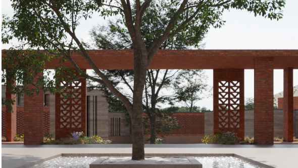
Education & Public Zone

of their short-term educational programs. Students from Blantyre would come to receive a basic education from visiting teachers, while foreign students would spend time learning from the village.